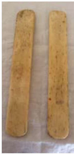
WWI Rhythm Bones - See Page 6