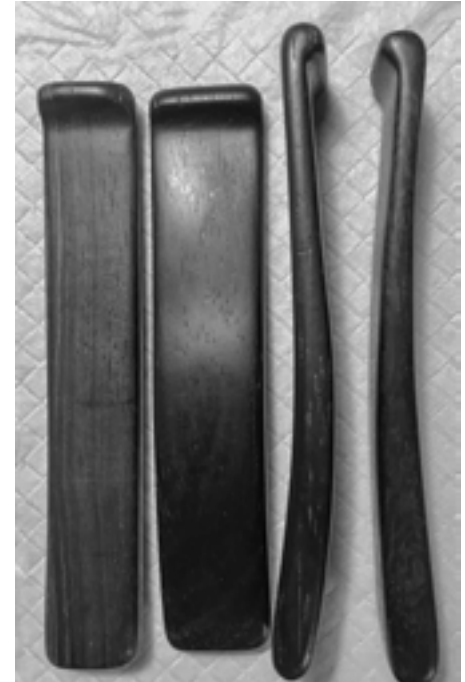
"Parker's rosewood bones that play themselves!"