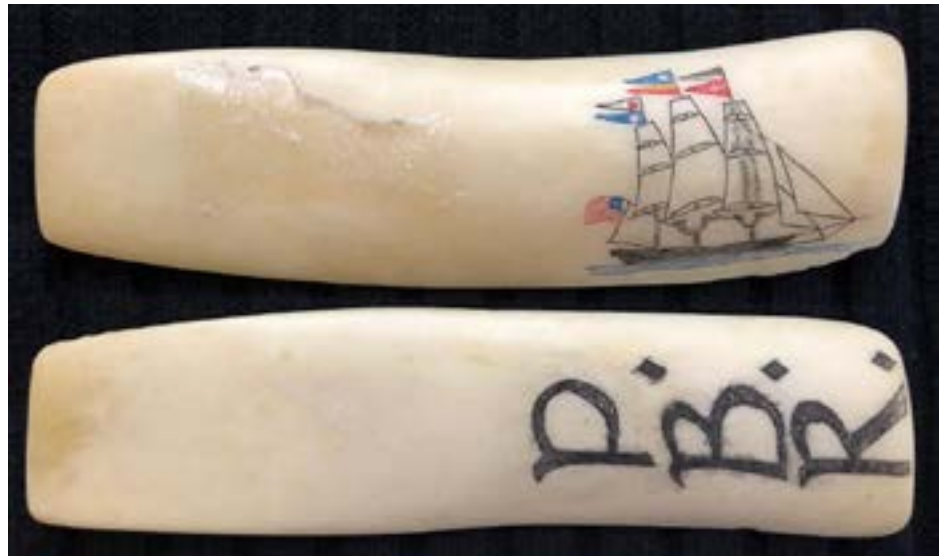
A good example of Tim Reilly's scrimshaw art. See Page 5, left column, for how he does it.