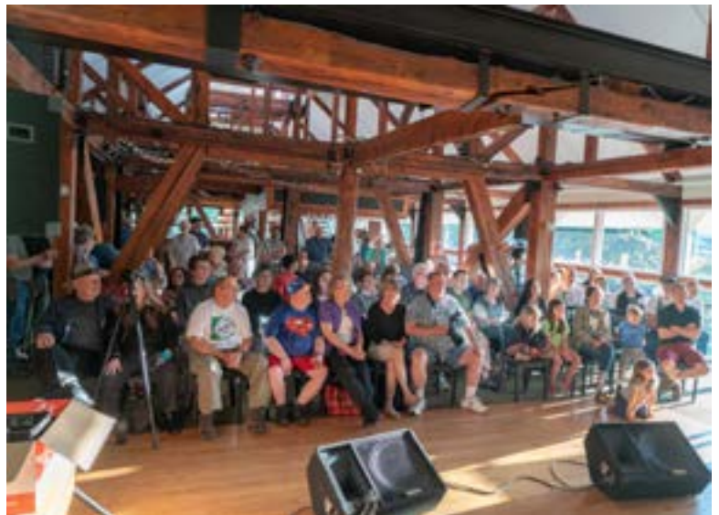
Saturday public performance audience (rest of One Love Brewery could hear)