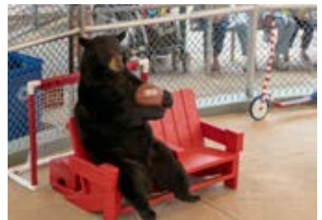
The bear in the Ring