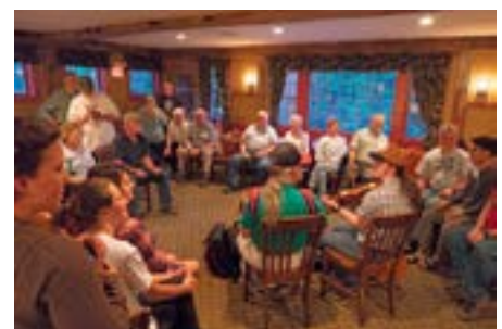
Thursday reception at Common Man Restaurant