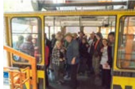
Tram to Cannon Mountain and group photograph