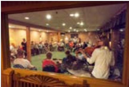
Friday night jam session at Indian Head Resort