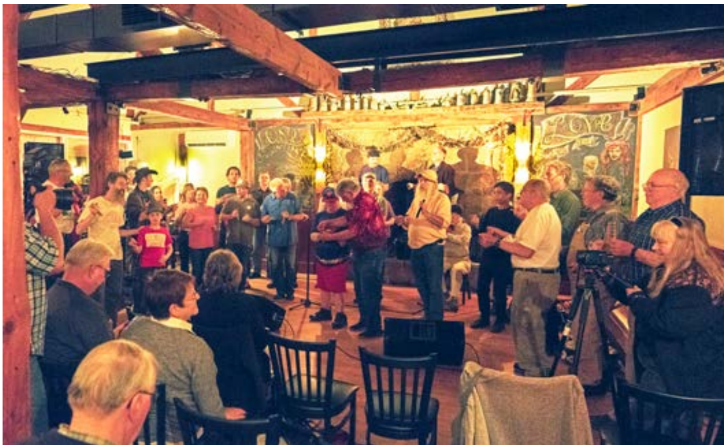
Grand Finale in the One Love Brewery