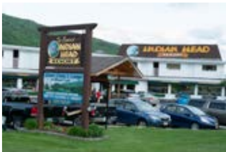
Indian Head Resort - the Fest hotel