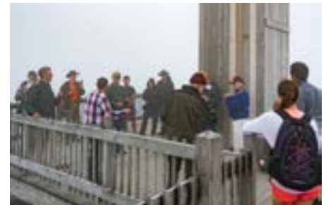
Jamming on the Observation Tower