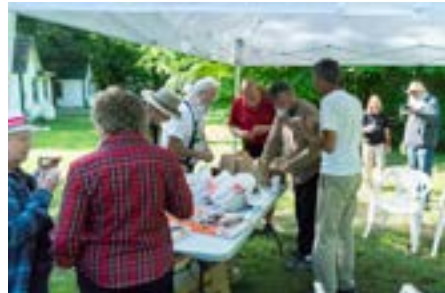
Saturday breakfast outdoors